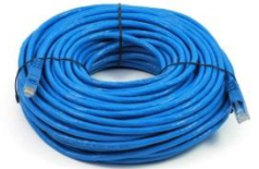
CAT 6 Cable