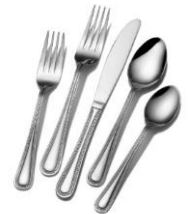
Pfaltzgraff Pearl 80 Piece Flatware Set