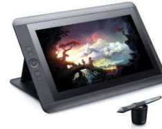
Wacom Cintiq DTK1300