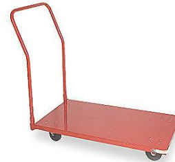
DAYTON Standard Platform Truck