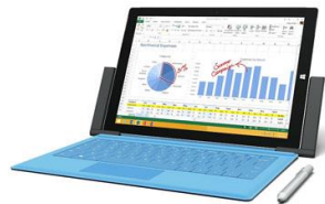
Microsoft Surface Docking Station