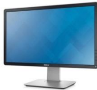
Dell Widescreen LED Monitor