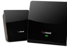
Wilson weBoost EQO "Echo" Home Cell Phone Booster