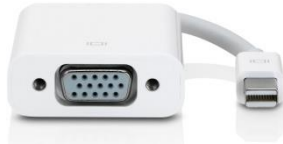
THUNDERBOLT Mini Display Port DP To VGA