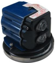
SLOAN Sensor Assembly